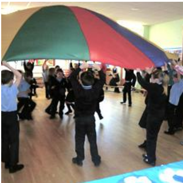
Enjoying the pancake game

During the half hour sessions the children were involved in colouring, word searches, quizzes and puzzles. There was a chance to have a go at tossing a pancake and much fun was had with a parachute game called pancake!!