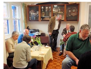
A busy dining hall